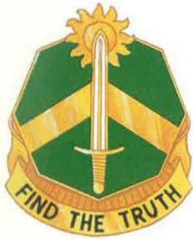
8th Military Police Group