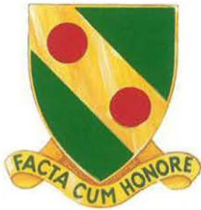
793d Military Police Battalion