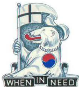
94th Military Police Battalion