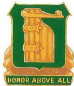
91st Military Police Battalion