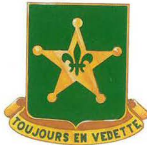
387th Military Police Battalion