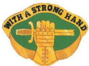
403d Military Police Camp