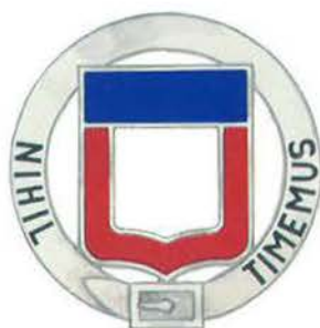
163d Military Police Battalion