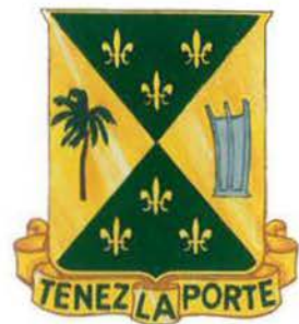
759th Military Police Battalion