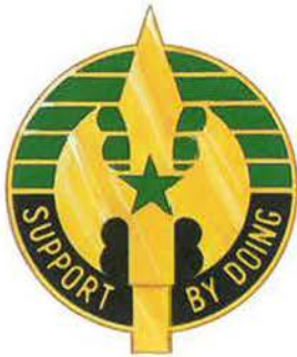
220th Military Police Brigade