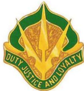
15th Military Police Brigade