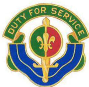
49th Military Police Battalion