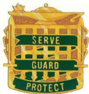
604th Military Police Battalion