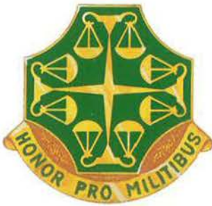
502d Military Police Battalion