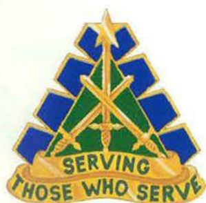
168th Military Police Battalion