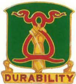
324th Military Police Battalion