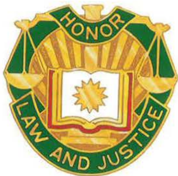
12th Military Police Group