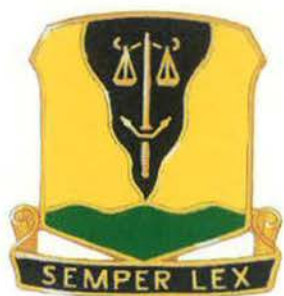
124th Military Police Battalion