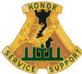
518th Military Police Battalion