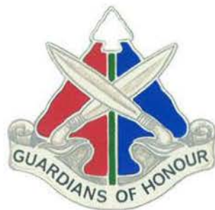
112th Military Police Battalion