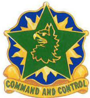
221st Military Police Brigade