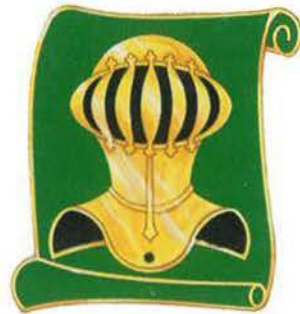
525th Military Police Battalion