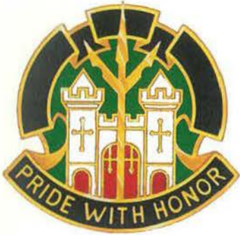
2d Military Police Group