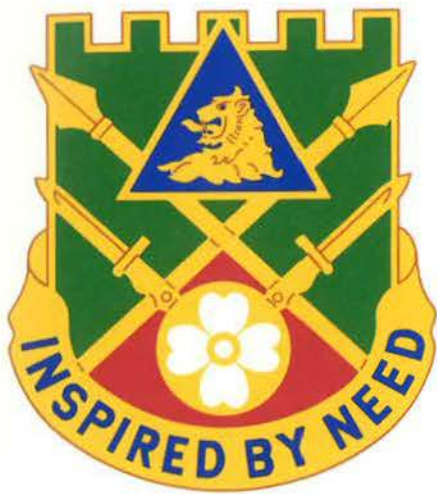
109th Military Police Battalion