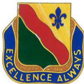
787th Military Police Battalion