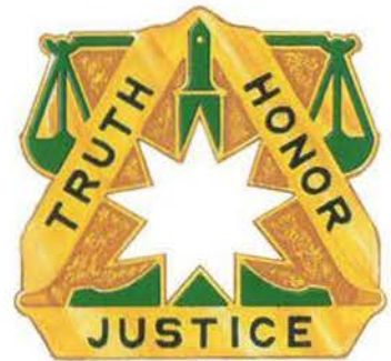
9th Military Police Group