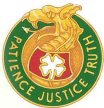
7th Military Police Group