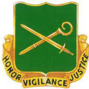
385th Military Police Battalion