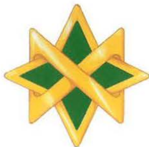
95th Military Police Battalion