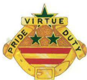
392d Military Police Battalion