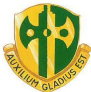
165th Military Police Battalion