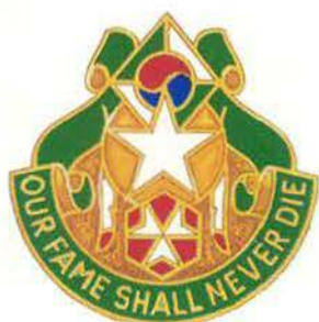
45th Military Police Battalion