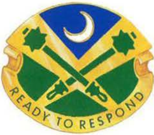
51st Military Police Battalion