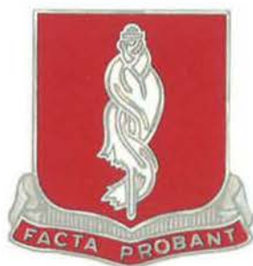
118th Military Police Battalion