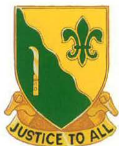
310th Military Police Battalion