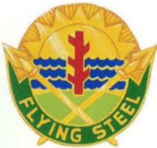
143d Military Police Battalion