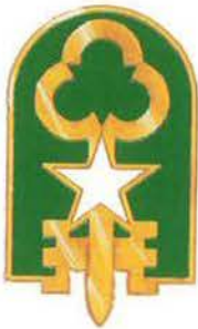
300th Military Police Command