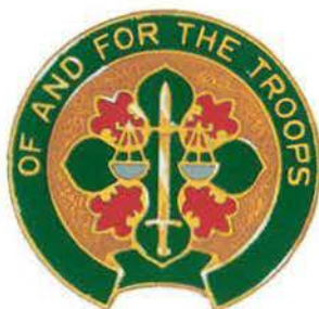
210th Military Police Battalion