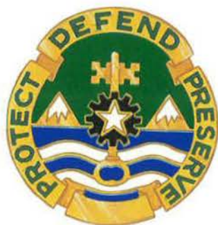
177th Military Police Brigade