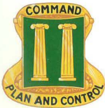
11th Military Police Group