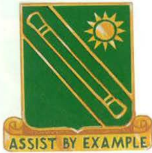
701st Military Police Battalion