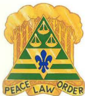
260th Military Police Brigade