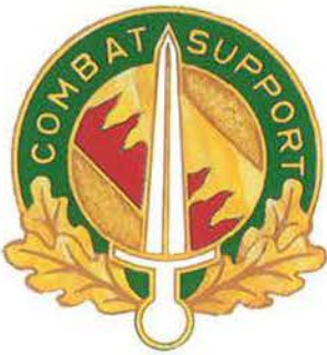
16th Military Police Brigade