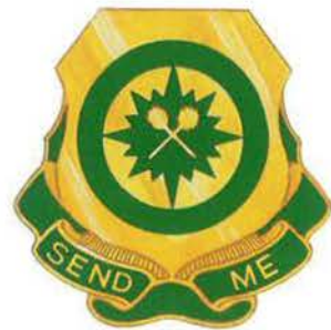
795th Military Police Battalion