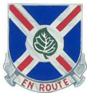
156th Military Police Battalion